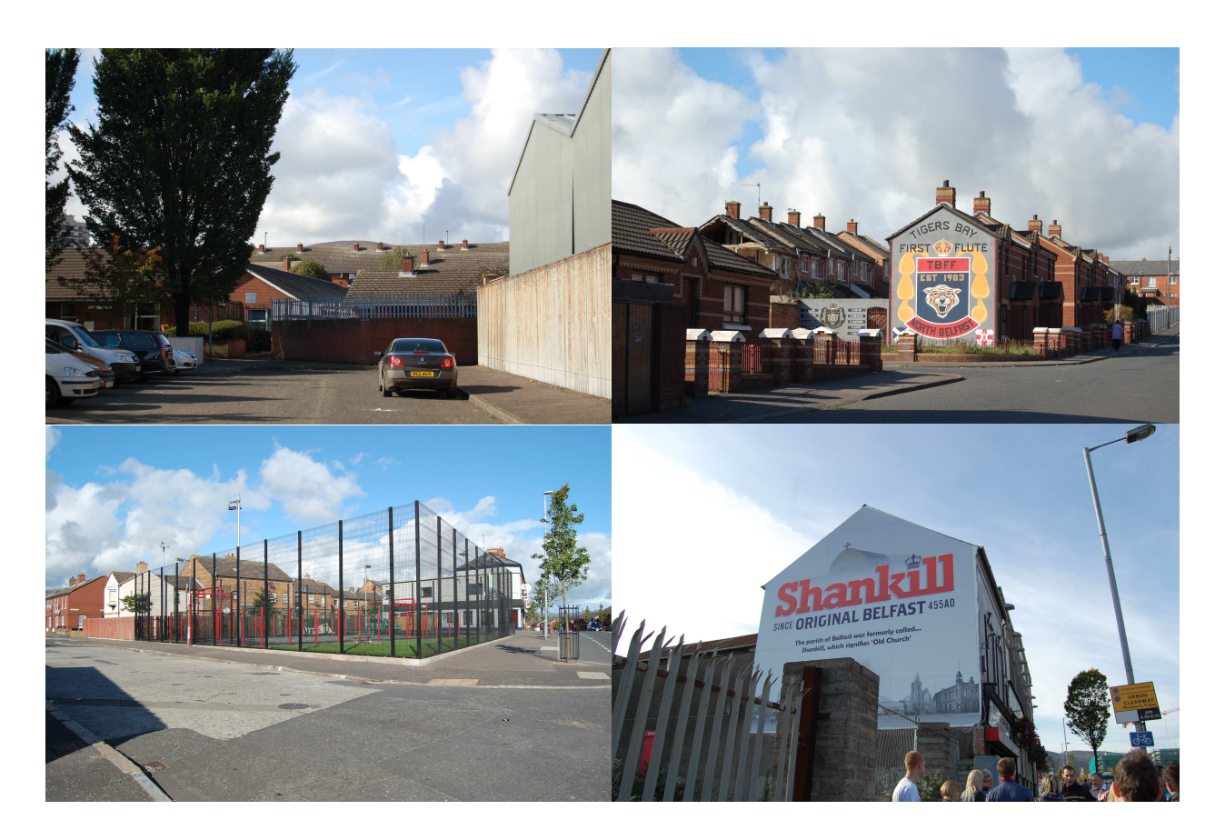
Fig. 1 - Murals and fences in North Belfast and the Shankill

This section provides the reader with an overview on the Belfast context. The roots of economic, political, social and cultural issues in Northern Ireland have been extensively investigated and have given rise to heated interdisciplinary debates during the period of violence and during the peace process. In this paper has proposed the spatial and morphological interpretation of the phenomenon, leaving the sociological and political to the copious literature available on this complex issue (Shirlow, Murtagh, 2006; Boal, Royle, 2006) We would simply point out some salient passages to help understanding the process of transformation of the physical-functional tissue of the city of Belfast.