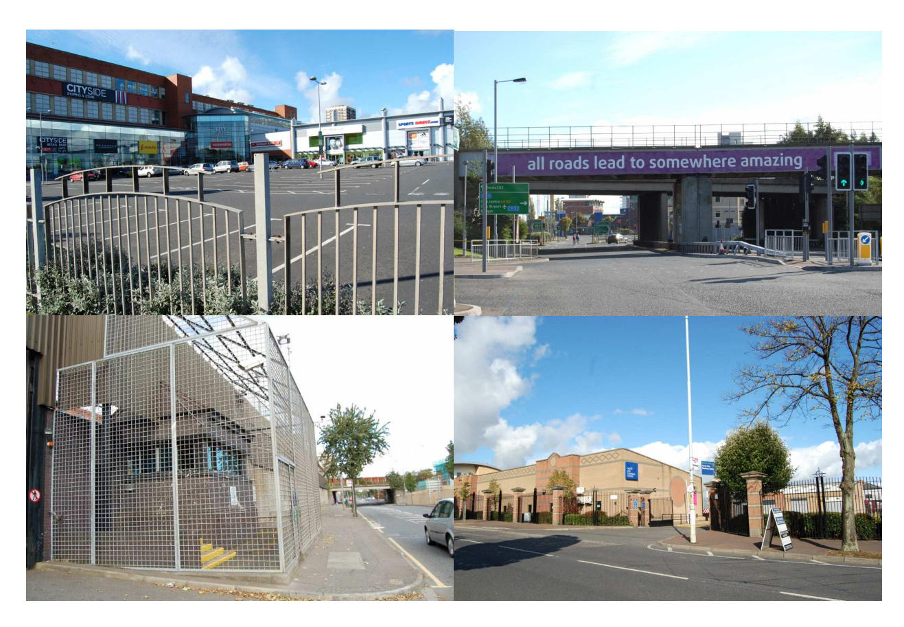
Fig. 3 – Extreme periphery in central areas, City Centre area, militarized police station, West link motorway cutting the city fabric, interface wall separating two neighbourhoods (photomontages made by authors)

Upon every defensive typology we can find the so-called peace lines: the walls of Belfast. (Boal, Royle, 2006) These different fences have been built for years to protect communities or to increase their perception of security. The multiplicity of fences and the no-man's-land around has been listed by the "Belfast Interface Project".