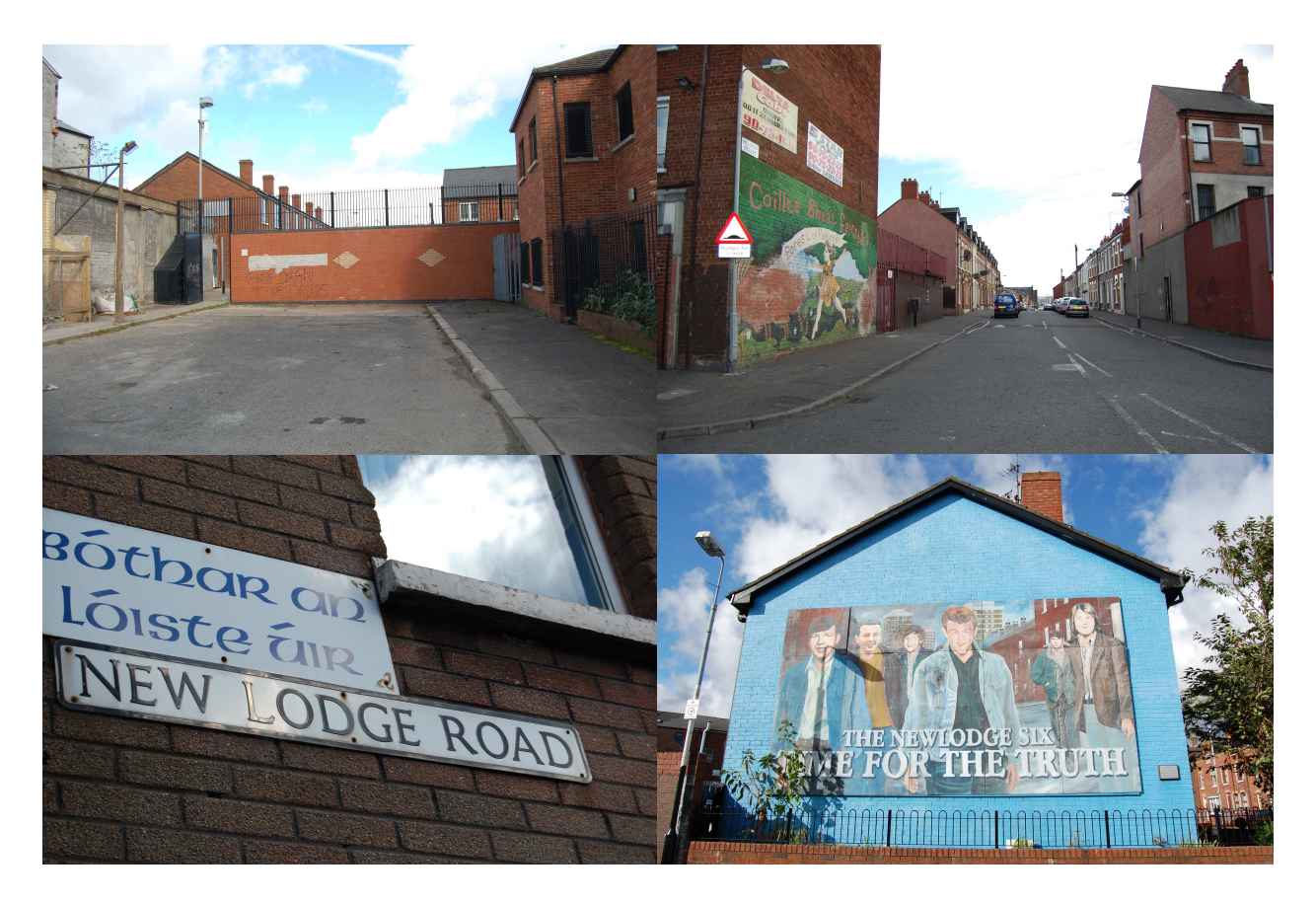
Fig. 2 - Barriers and murals in the New Lodge catholic quarter (photomontages made by authors)

representation. A kind of trench warfare, which saw the Catholic community in a subordinate position and increasingly deprived of the opportunity to express their discomfort through traditional channels of democratic representatives. (Horgan, 2006) These socio-political processes that have been merged with urban transformation processes, either explicitly or implicitly, oriented to the segregation, both in terms of social class and in terms of sense of community. (Boal, 1995) Population growth in the first half of 1900, together with the disposal of industrial and economic crisis, have contributed to stress deprivation phenomena and the processes of expulsion and auto-segregation at the neighbourhood scale, paving the way for the explosion of the "troubles" of the 1969. (Branson, 2007) This season of blood has been interpreted by scholars of all and has produced visual art and literature, collected and exposed by the Linen Library of Belfast preserves and presents the documentation of these terrible years of violence, which burned in fifteen years more lives than a conventional military conflict.